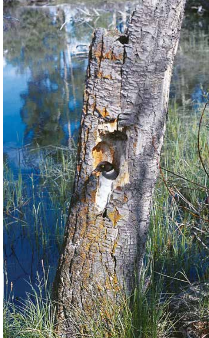
A female Barrow's Goldeneye leaves its nest hole near Riske Creek on the Chilcotin Plateau. Sixty to 90 per cent of the world population of this duck lives in British Columbia, breeding on Interior lakes and wintering on protected coastal inlets.

After you can answer the simple “What is it?” questions on your explorations of nature, you are ready to go on to the much more interesting questions of where, how, why and when. You are ready to read the landscape, meaning that you keep your eyes and the rest of your senses open for patterns and continually ask yourself questions. Why are all the big trees here Ponderosa Pines but all the seedlings Douglas-firs? Why is this patch of flowers still blooming when all the other ones have gone to seed? Why is this pond ringed with Cattails and that one completely bare of vegetation? Reading